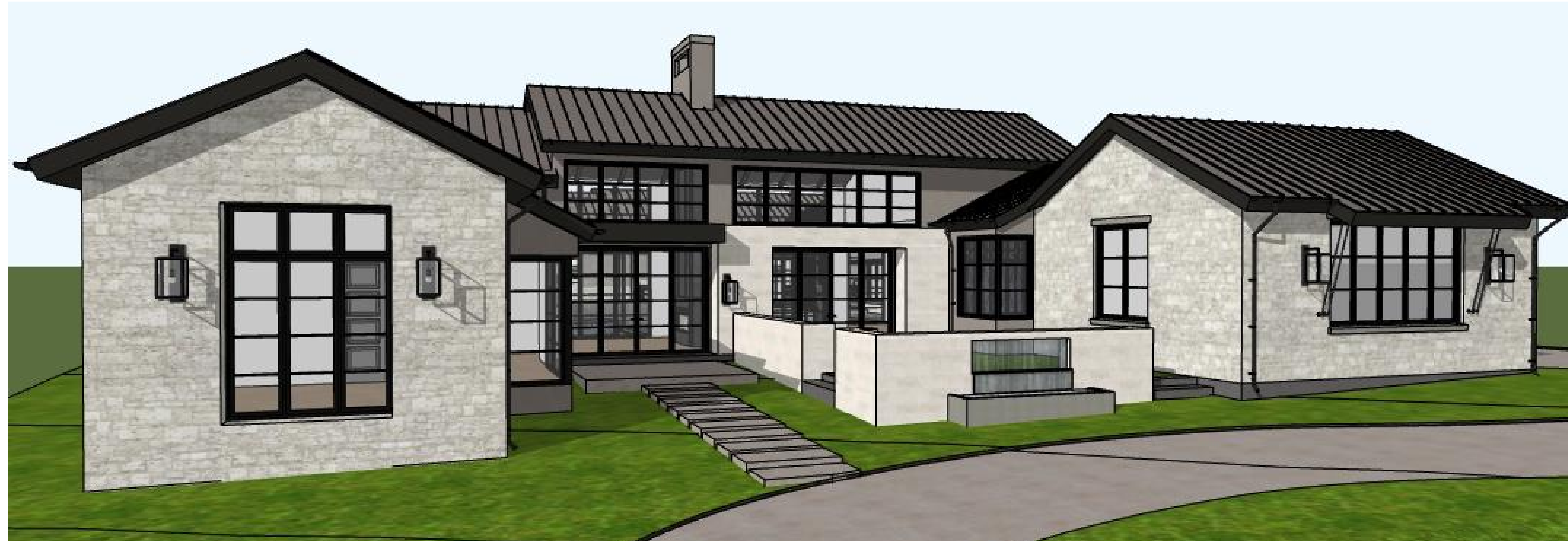
(ORIGINAL COVER ART - FINAL DESIGN MAY VARY)